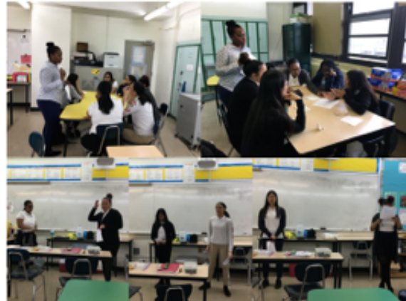
Team-1 & Team-2 preparations Opening statements, Responses, Closing arguments